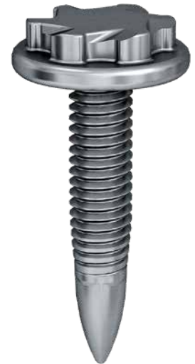
FDS® M4 High-Strength