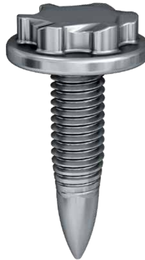
FDS® M5 Standard

These new lightweight designs have increased usage of high-strength steels whose tensile strengths are >600 MPa. For these types of applications, EJOT has developed the FDS® M4 High-Strength screw that meets the high demands of these types of materials while also directly contributing to weight savings.