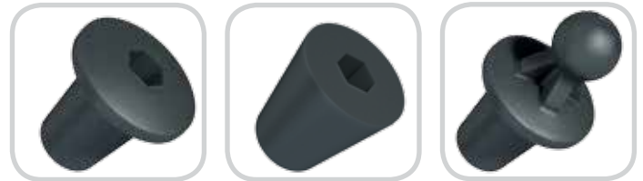
EJOT TSSD® Ø 9 x 12

The EJOT TSSD® (thermal adhesive bonding boss / German: Thermischer Stoff-Schluss-Dom) has been developed including the appropriate joining process, in order to realise fastening options for lightweight material. The process is suitable for sandwich elements with hollow core and foam core structures with different top layers preferably with fibre content. The TSSD® can be used as a screw boss for the DELTA PT® screw, or directly as fastening element.