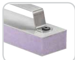
XPS-foam + PS GF top layer Pull-out force 500 N