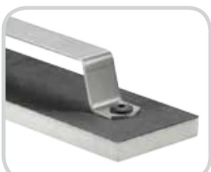
Rohacell foam + CRP top layer Pull-out force 1,300-1,700 N