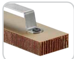
Aramid honeycomb + Aramid fibre top layer Pull-out force 700-1,200 N