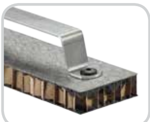
Paper honeycomb + PUR GF top layer Pull-out force 900 N