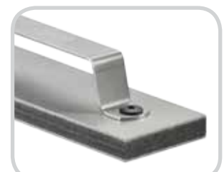
PP GF Foam + PP GF top layer Pull-out force 1,900 N

For more information please contact Niko Müller, phone +49 2751 529-5959, e-mail nmueller@ejot.de