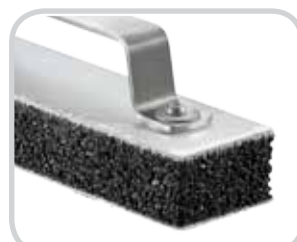
EPP foam + PP GF top layer Pull-out force 500-900 N