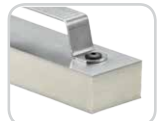
PUR foam + 0.6mm Aluminium AW3003 Pull-out force 800 N