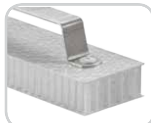
PP honeycomb + PP GF top layer Pull-out force 800 N